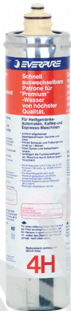
4H Replacement Cartridge: EV9610-00 (1 pack) EV9611-00 (6 pack)

Delivers premium quality water for hot cup vending applications